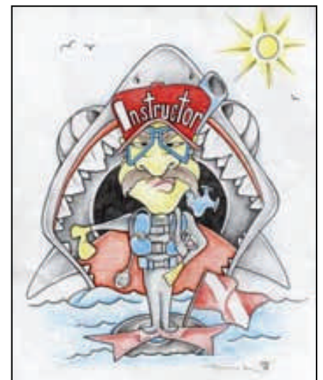
Sketched By: Timmy Li

Books - British Columbia - book from Lonely Planet www.lonelyplanet.com 151 Dives - By: Betty Pratt-Johnson