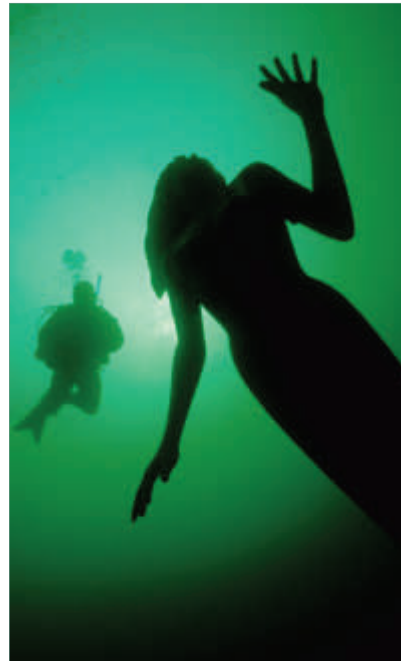
Photographer: Ron Akeson - Powell River

IQueen Charlotte Strait offers soft corals, sea otters and whales. Nakawakto Rapids is the only place to find red-lipped goose-neck barnacles. Wrecks, sea lions, and basket stars too!